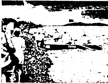
The Finish at Munyonyo

In April last year, six brave rowers crossed Lake Victoria in search for adventure and for money for three charities: Nsambya Babies home, Hospice Uganda and Rhino Fund. The row – from Mwanza in Tanzania to Munyonyo in Uganda – took them five days and twenty minutes, an enormous achievement that most likely will make it to the