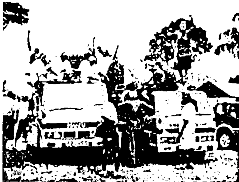
Two of the teams preparing for the race

On September 1 st , Nile River Explorers organized the Rhino Raft Race in support of Rhino Fund Uganda. 17 Teams competed on the first stretch of the Nile, between the dam and Bujagali Falls. For the rafters it was hard work but they came back to good food and plenty of drinks! It was a great day and many thanks go to the NRE team for raising over 8 million Ushs (over 4,000 USD).