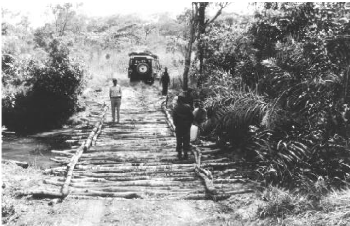
Temporary bridge built with young Brachystegia trees across one of the many streams in the Horogwe area.