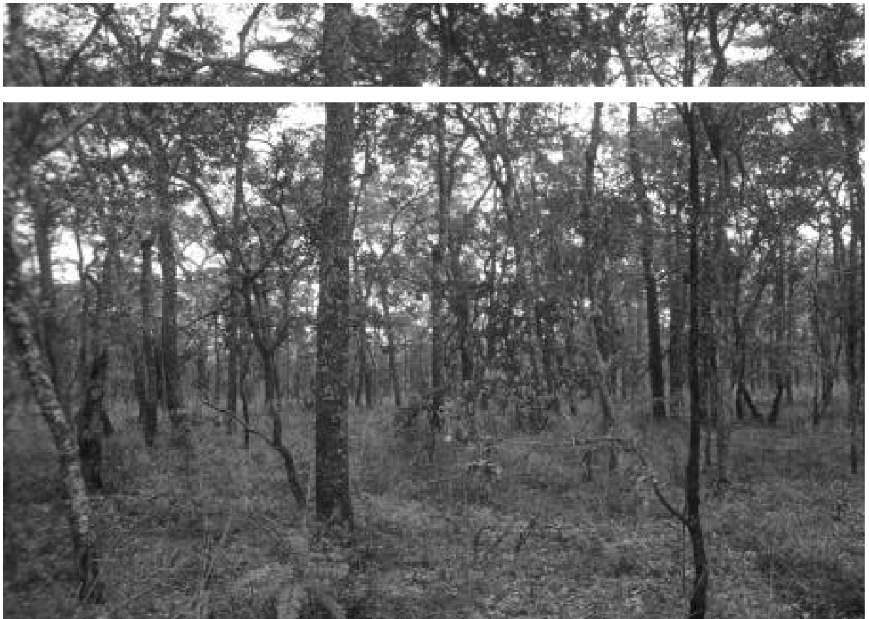
The ubiquitous Brachystegia woodlands dominate the Selous Game Reserve vegetation southwards from the Rufiji River.