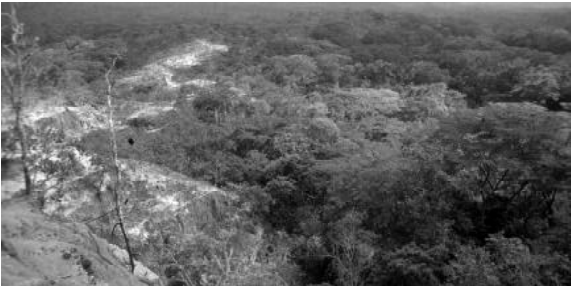
One of the many eroded ridgetops in the Naluale area.