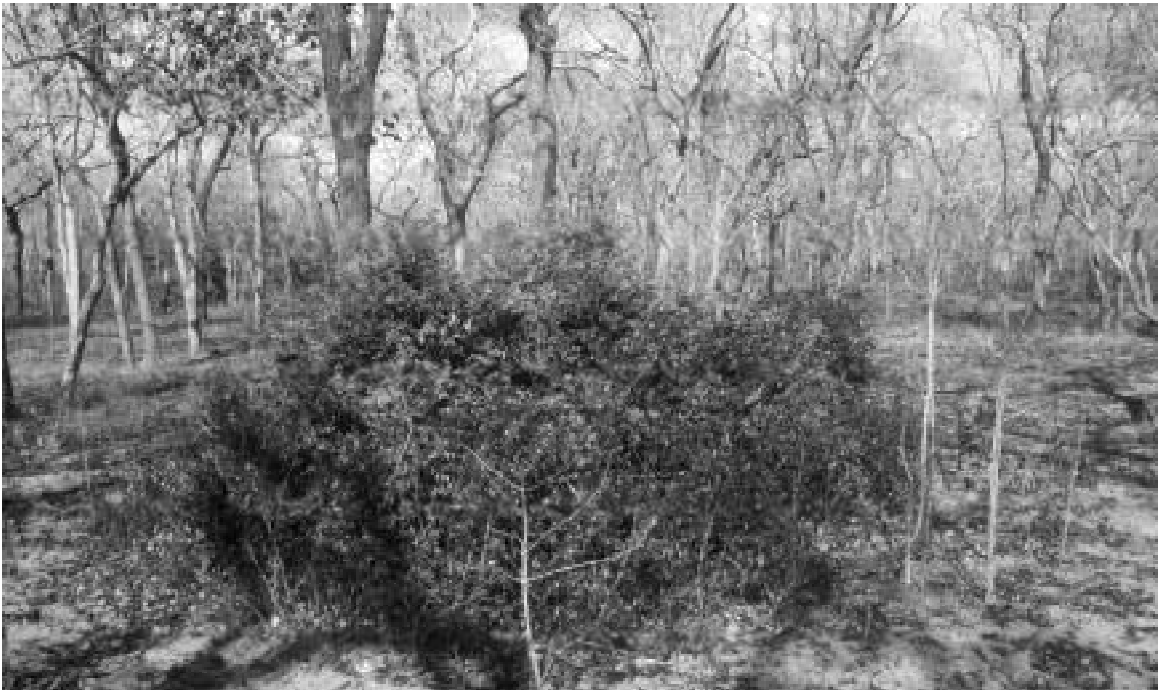
Many of the smaller patches of thicket appear to be decreasing in area as a result of annual dry-season fire damage.