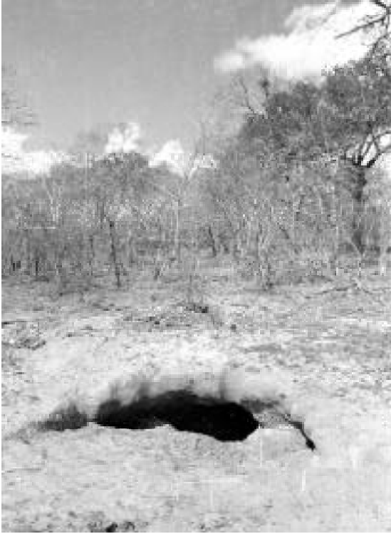
A shallow dry-season waterhole in the bed of the Nahomba River near its headwaters.

serves further investigation in light of the importance of these thickets for rhinos.