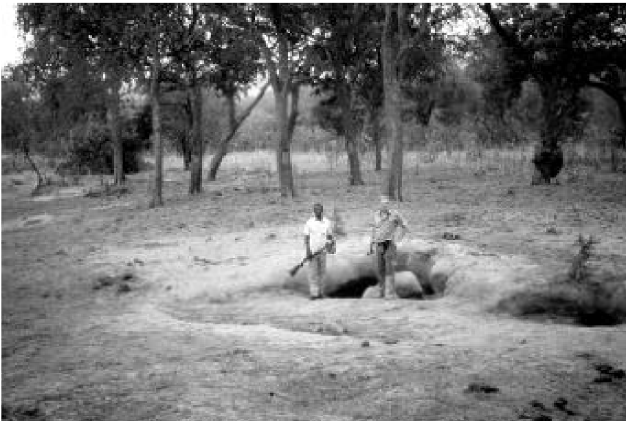
A relatively large thicket waterhole at the onset of the dry season.

return to cover shortly before daylight. In this way they reduce the risk of being ambushed by poachers.