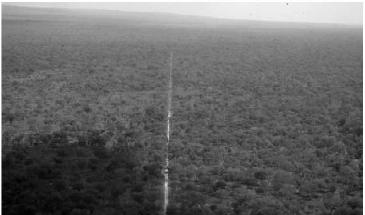
Aerial view of one of the many seismic cut lines.