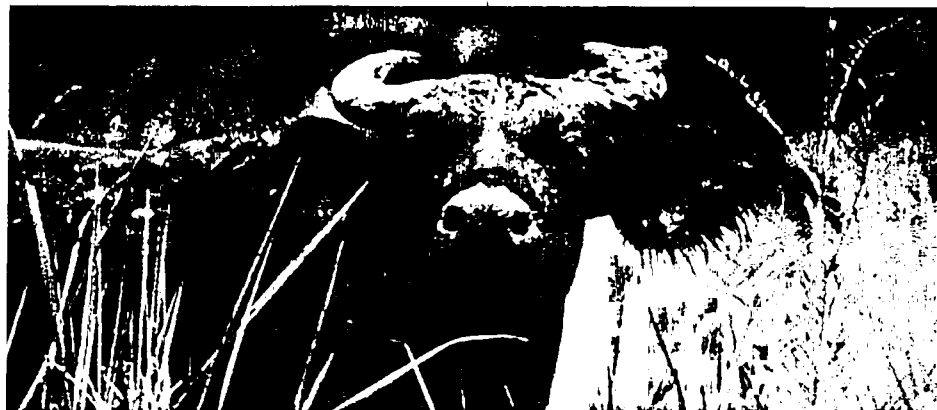
Red buffalo are just one of Angola's many interesting wildlife species.

The giant sable was primarily located in the Luando Strict Nature Reserve and the Cangandala National Park in the Malanje