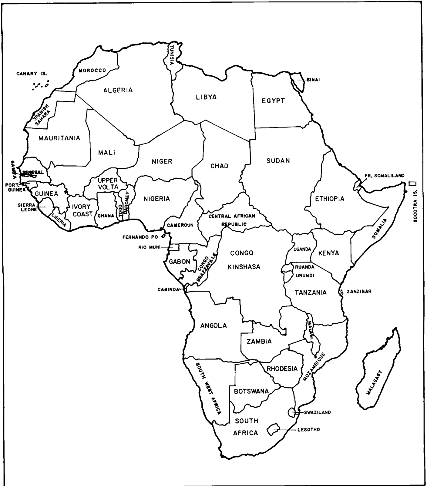
Political subdivisions of Africa