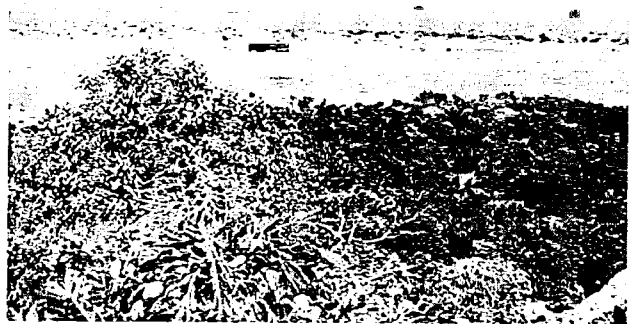
Potential rhino sanctuary location: Ziwa Ranch in Luwero

Although the land had been mentioned as a good option in the feasibility study of 1997, the particular private ranches were never assessed. In the next month we plan to do a vegetation study to determine the carrying capacity for black