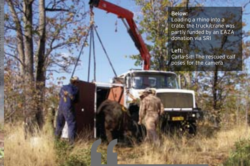
Below: Loading a rhino into a crate, the truck/crane was partly funded by an EAZA donation via SRI