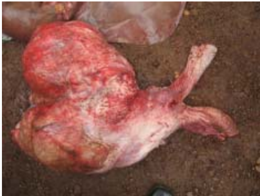
Fig. 3. Showing uterine tumour