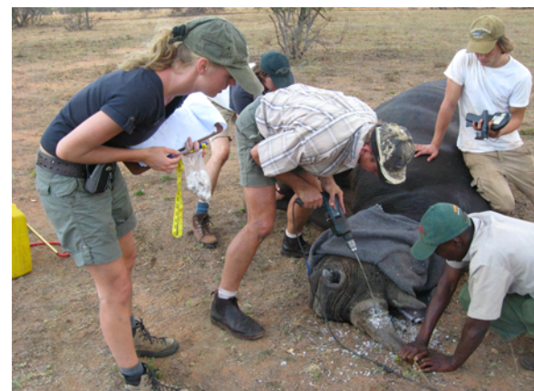
Figure 2 – Addition of radio transponder. A team of veterinarians drilling a hole in largest horn of immobilized Motklaki.

home ranges have been accurately identified for this study, by gathering documented data on the behaviour and home range (sizes) of population