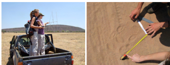
Figure 3 – VHF radio telemetry (left) and footprint tracking (right), two methods used in this study for tracing rhinoceroses.

Each rhinoceros was tracked and observed at least once a week, during the first or last 3 hours of daylight (starting at respectively 5:45h and 14:00h). Documented information available in the reserve defined the home ranges of each rhinoceros. By car we went to a starting point (often the place where feeding takes place during the dry season, rhinoceroses tend to remain close to where the food is deposited for them). From there, tracking would take place. For which we often had to leave the car and proceed by foot. Identification followed a combination of VHF radio telemetry (Communications Specialists 148/152 MHz manufactured by Africa Wildlife Tracking cc, Rietondale, Gauteng, South Africa), on foot track-tracing, ear-notch identification and other physical characteristics of the rhinoceros. Also a