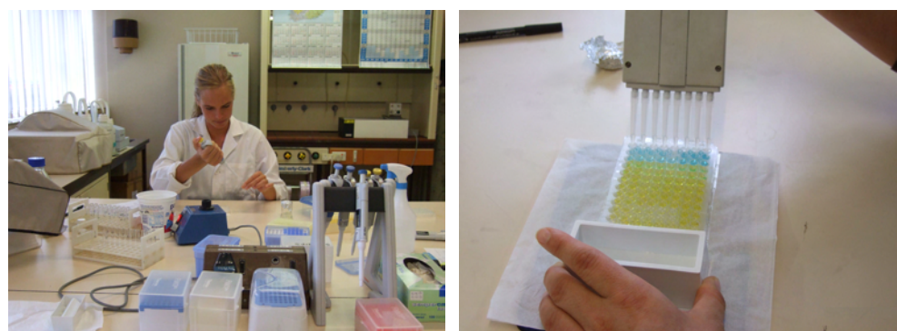
Figure 6 – Dispensing stop reagent H 2 SO 4 into each well (left). The blue colour turns yellow (right).

The mean fecal pregnane concentration was 273.3 ± 97.8 ng/g feces for Motklaki. In Radimpe, the mean pregnane concentration, during the 50 days prior to parturition, was 412.4 ± 144.2 ng/g feces. After parturition, Radimpe showed a mean concentration of 25.8 ± 26.7 ng/g feces, significantly different to her pregnant concentration mean ( t -test: two-sample assuming unequal variances, p <0.05, N=5, N=6). The concentration declined to follicular phase values within 9 -12 days post partum and remained in this range for the following month. Linear mixed-effects modelling with random animal effects and time and animals and their interaction as fixed effects, showed a significant