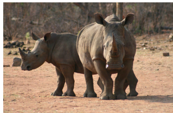
Figure 1 – A southern white rhinoceros adopting a rump-to-rump posture of alertness, by pressing herself against her calf [Owen-Smith, 1992].

number seems viable, rapid decimation of the population, as observed in other rhinoceros species, should be avoided. Being classified as “Near-Threatened” on the IUCN’s Red List of Threatened Species, the southern white rhinoceros population is subject to attention and highly dependent on effective protection and intensive conservation and management [Amin et al., 2003; Hermes et al., 2005].