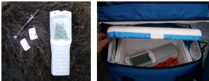
Figure 5. The i-STAT®1 analyser used for field analysis of arterial blood samples (left). Storage of the i-STAT®1 during fieldwork to ensure optimal temperature conditions (right).

Arterial samples were collected anaerobically by using self-filling arterial syringes with heparin (PICO™70, Radiometer Copenhagen, Brønshøj, Denmark) (Fig. 5). In carnivores, the femoral pulse was palpated in the groin and the needle was introduced percutaneously into the femoral artery, confirmed by pulsating blood. Firm pressure was applied to the sample site for 2 min post-sampling to avoid bleeding. In rhinoceros, samples were collected from the artery on the medial aspect of the ear (Fig. 4).