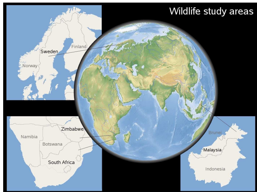
Figure 3. Study areas in Northern Europe, Southern Africa and South-East Asia.

Twenty-five anaesthetic events of 24 free-ranging wolverines (12 adults, 12 juveniles) were studied in and around Sarek National Park, north of the Arctic Circle in Sweden. Anaesthesia was carried out at altitudes of 500–1,300 m above sea level with an ambient temperature of -5 to +25^{\circ}\text{C} . The wolverines were anaesthetised as part of the Swedish Wolverine project with approval from the Ethical Committee on Animal Experiments in Umeå, Sweden.