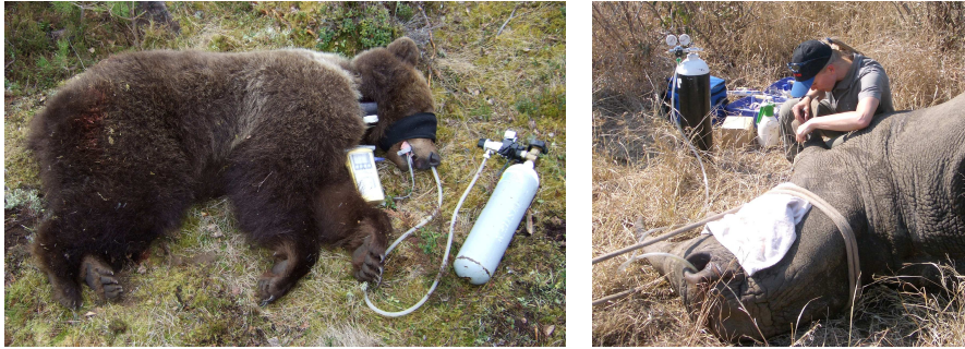
Figure 4. Intranasal oxygen supplementation to an adult female brown bear anaesthetised for radio-collaring in Sweden (left). Blood sampling from an auricular artery of an adult white rhinoceros receiving intranasal oxygen during immobilisation for translocation in South Africa (right).

diprenorphine i.v. at 2.2–3.5 times the etorphine dose, or naltrexone (Trexonil ® , 50 mg naltrexone HCl/ml, Wildlife Pharmaceuticals Inc., Fort Collins, Colorado, USA) i.m. at 20 times the thiafentanil dose. In white rhinoceros, 12–24 mg diprenorphine i.v. was administered for loading into transport containers, and naltrexone i.v. at approximately 20 times the etorphine dose was used for reversal in the boma or in the field.