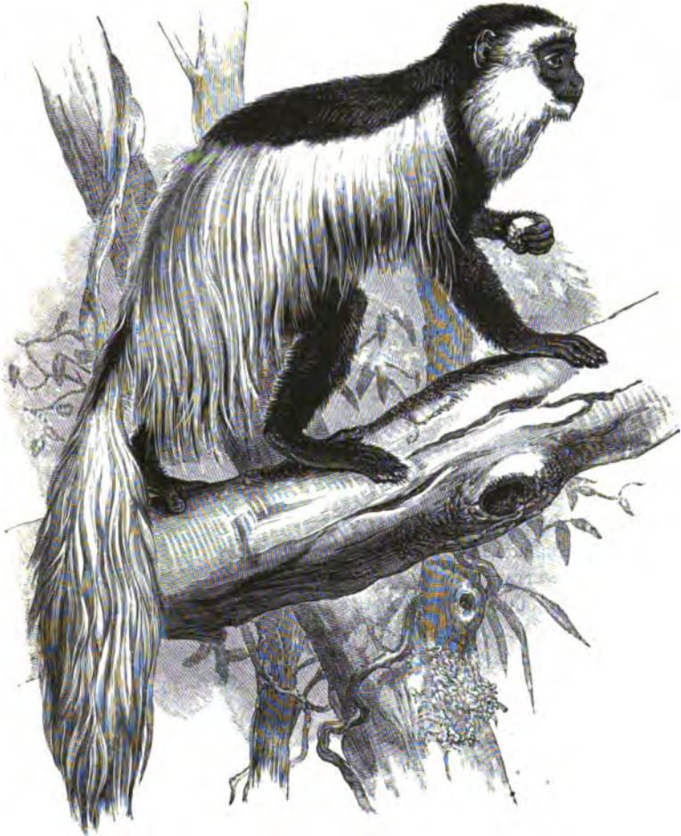
Fig. 72.— Colobus Guereza , var. Caudatus .

Taking now into consideration the extreme constancy of the markings of the Colobi , the very different appearance that the present animal has from the usual type, its restriction to a small district round Kilima-