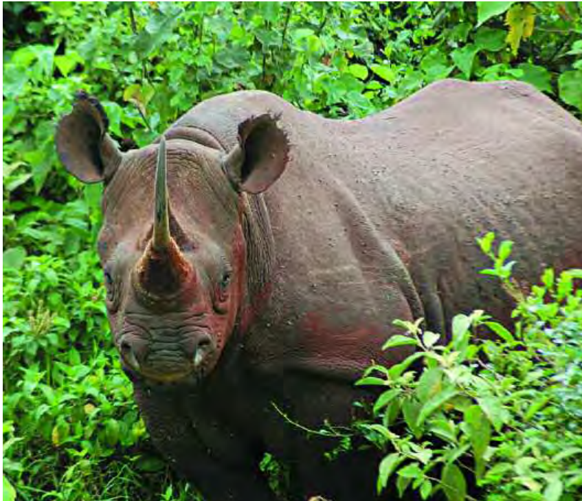
Winner of Arkive Best Rhino picture