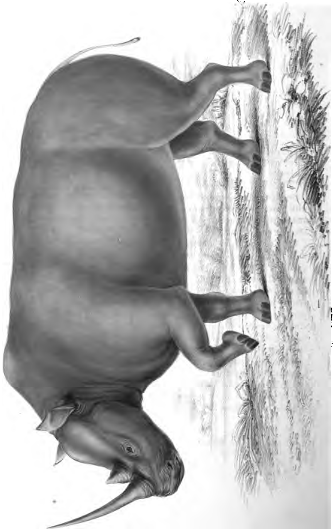
PLATE 100 Rhinoceros