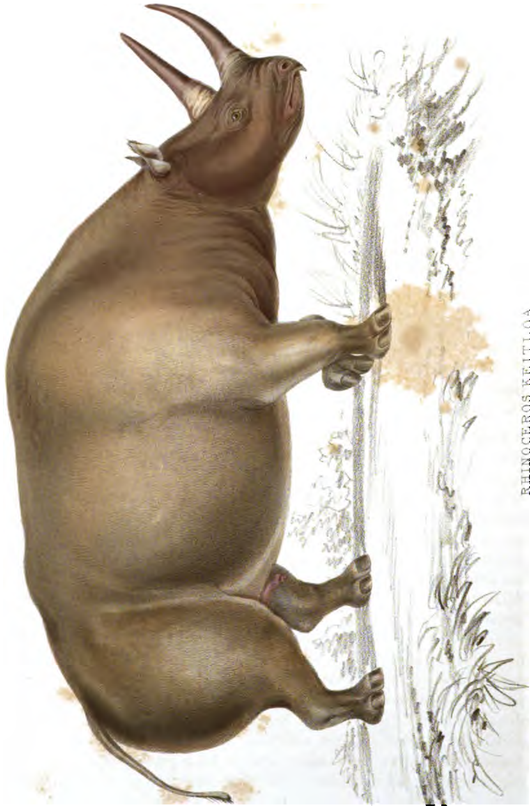
RHINOCEROS KEITLOA (Mammalia Plate 1)