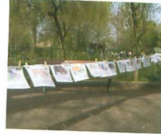
Cologne Zoo, France