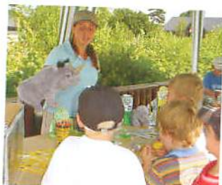
Colchester Zoo, UK