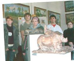
Dvur Kralove Zoo, Czech Republic