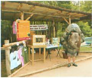
Amnéville Zoo, France