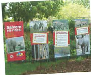
Barcelona Zoo, Spain