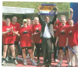
Dutch Zoo Federation