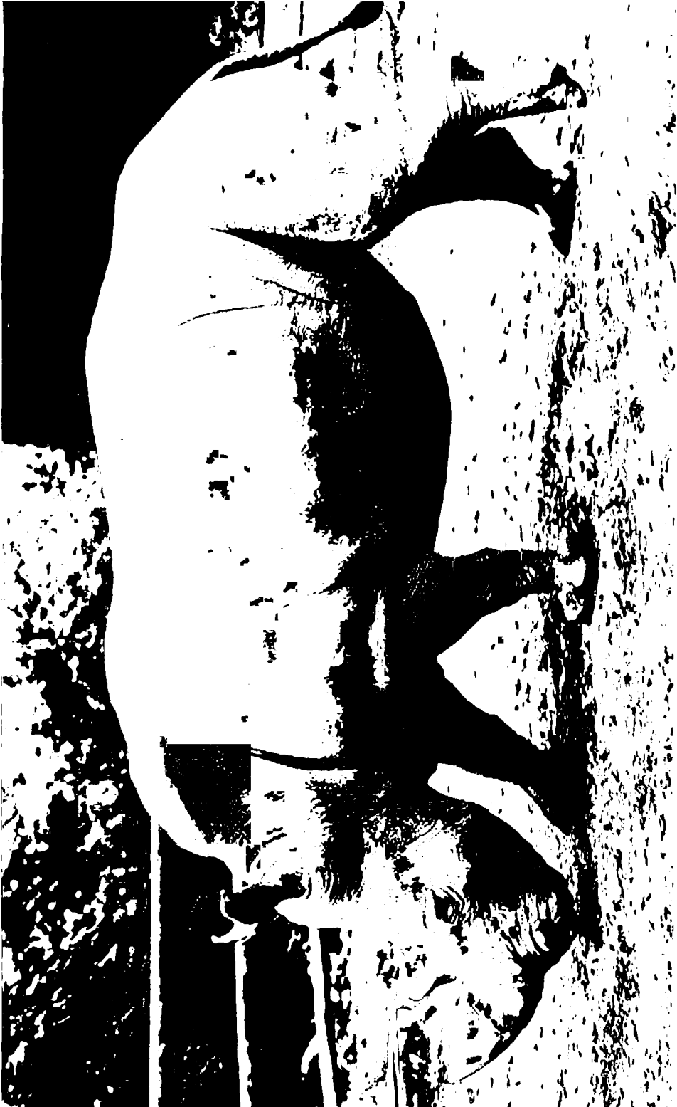
Das männliche Breitmaulnashorn ZULU im Tierpark Berlin. The male White Rhino ZULU in the Tierpark Berlin.