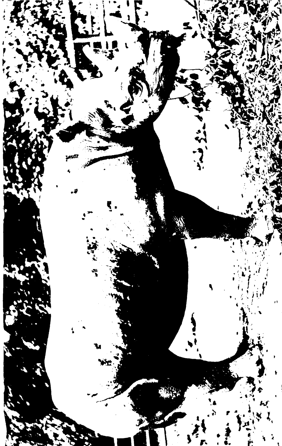
Das weibliche Spitzmaulnashorn LADY im Tierpark Berlin. The female White Rhino LADY in the Tierpark Berlin.