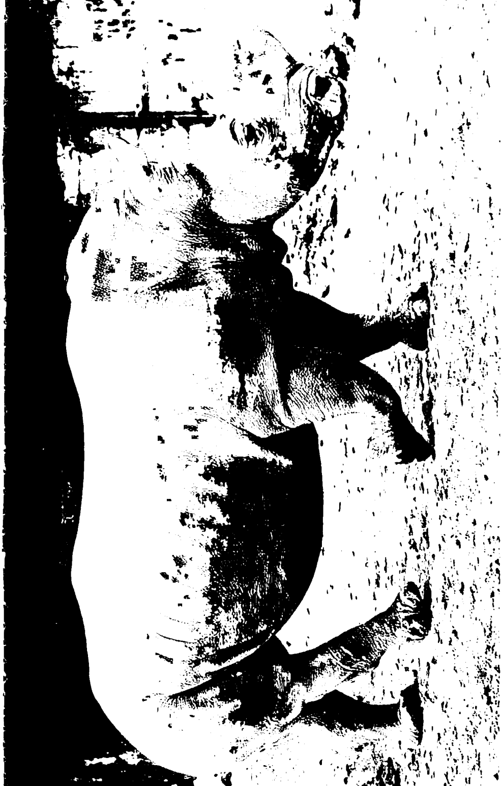
Das weibliche Breitmaulnashorn LOZI im Tierpark Berlin. The female White Rhino LOZI in the Tierpark Berlin.