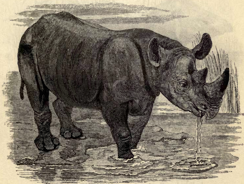
Rhinoceros bicornis ♂.