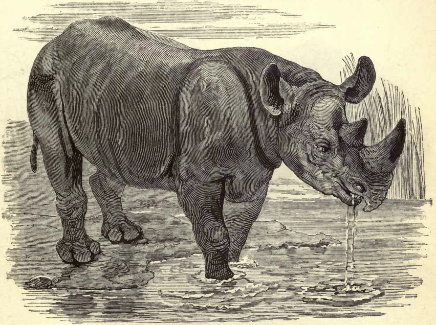
Rhinoceros bicornis ♂. ('Nature,' vol. v. p. 427.)