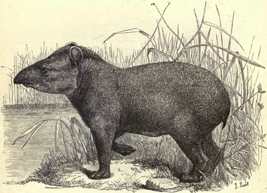
Tapirus americanus. (P. Z. S. 1873, p. 194.)