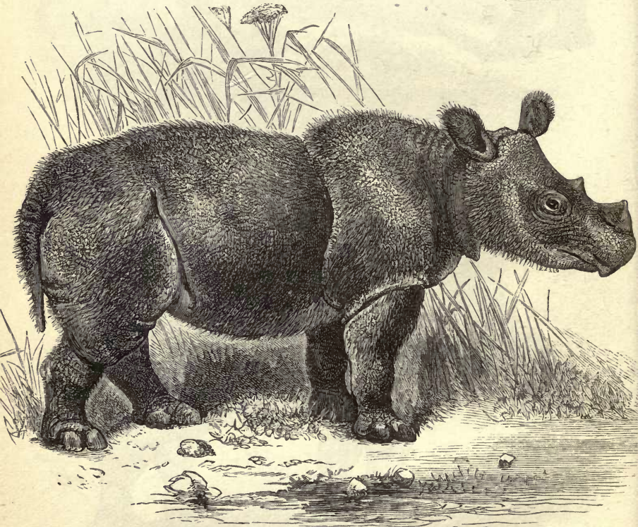
Rhinoceros sumatrensis . ('Nature,' vol. vi. p. 518.)