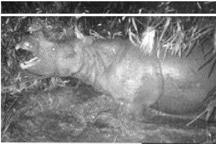
Photo 4. Javan rhino in wallow in Cat Tien National Park (location B, May 17, 1999, 04:00).