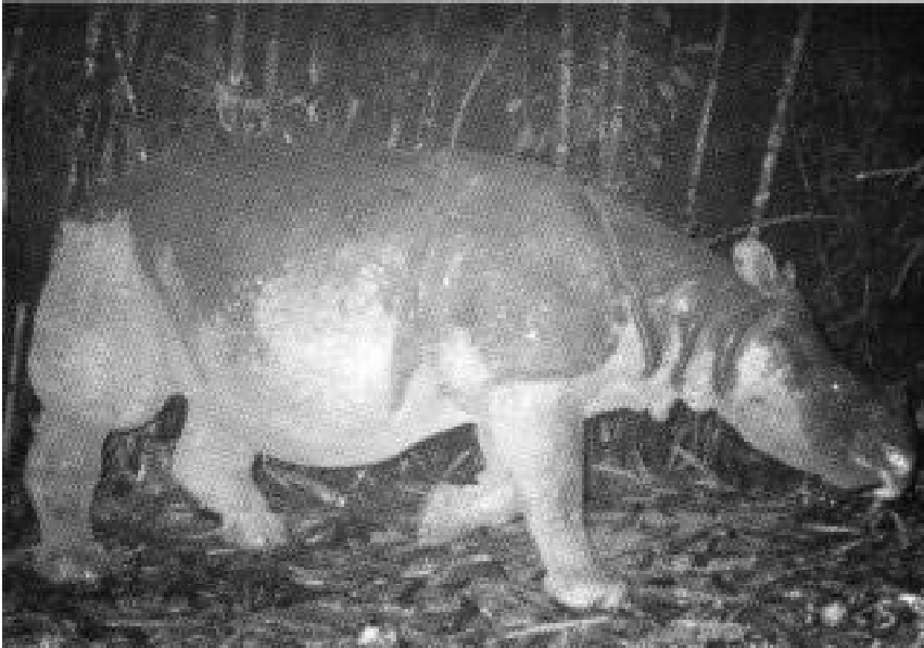
Photo 2. Full size Javan rhino in Cat Tien National Park (location A, May 11, 1999, 22:54).