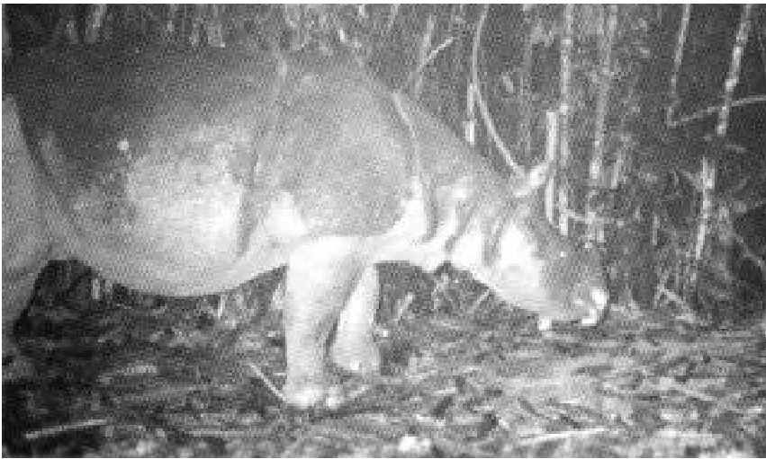
Photo 1. First-ever known picture of Javan rhino in Cat Tien National Park, Vietnam (location A, May 11, 1999, 22:54).