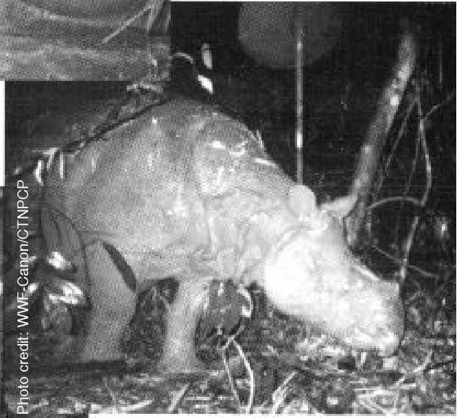
Photo 6. Javan rhino in Cat Tien National Park (location C, May 25, 1999, 19:37).