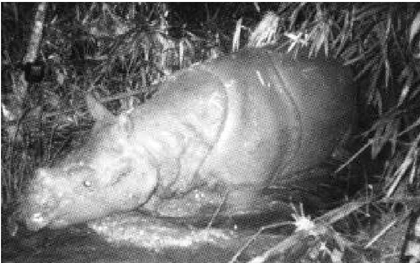
Photo 3. Javan rhino in wallow in Cat Tien National Park (location B, May 17 1999 04:00).