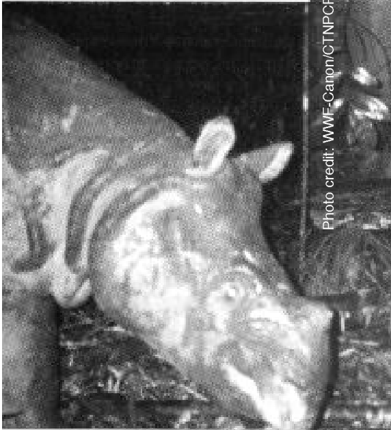
Photo 5. Head of Javan rhino in Cat Tien National Park (location C, May 19, 1999, 3:21).