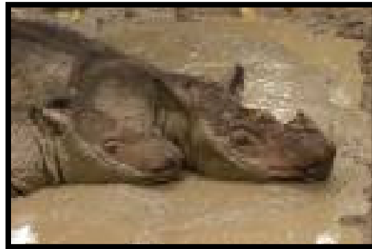
Sumatran rhino