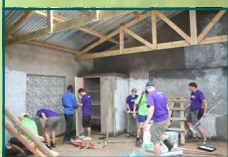
Painting the school

The Challenge is an initiative from UK where 64 companies compete against each other in leadership skills. The finals were in Majete. Four teams, 40 people, 3 days, a challenge for both them and the Majete team. The teams donated a school block in Namitsempha. In Majete they helped with the building of a signpost and a drift.