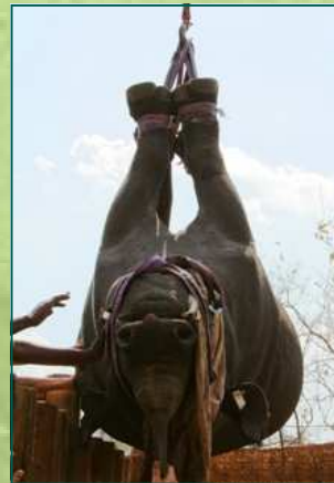
Moving rhino into boma

After months of preparation, the moment was finally there! In the early morning of the 1st of November, a big truck with six crates arrived at the Gate of Majete.