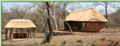
Bar and Braai