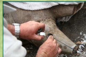
Transmitter in horn

After a few days Lundu (male), Shamwari, Cassia, Callista, Kumi and Reagan (females), were released in Majete. Each one in a different sector of the reserve. Black rhino are known as very territorial animals and we don't want them to fight each other!