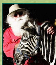
Santa on safari

And your first good intention for 2008 will be to visit Majete of course!