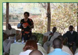
Handover to Minister