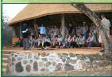
At the camp site

The Challenge is an initiative from UK where 64 companies compete against each other in leadership skills. The finals were in Majete. Four teams, 40 people, 3 days, a challenge for both them and the Majete team. The teams donated a school block in Namitsempha. In Majete they helped with the building of a signpost and a drift.