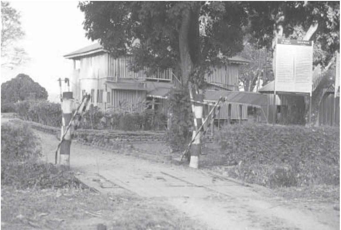
Tourists to Gorumara National Park can spend the night there only when the small, 2-suite Forest Guest House is not being used by government officials.

sistance), and for Royal Bardia National Park's 968 km 2 it was about USD 700/km 2 (also excluding NGO assistance), based on Martin (1998).