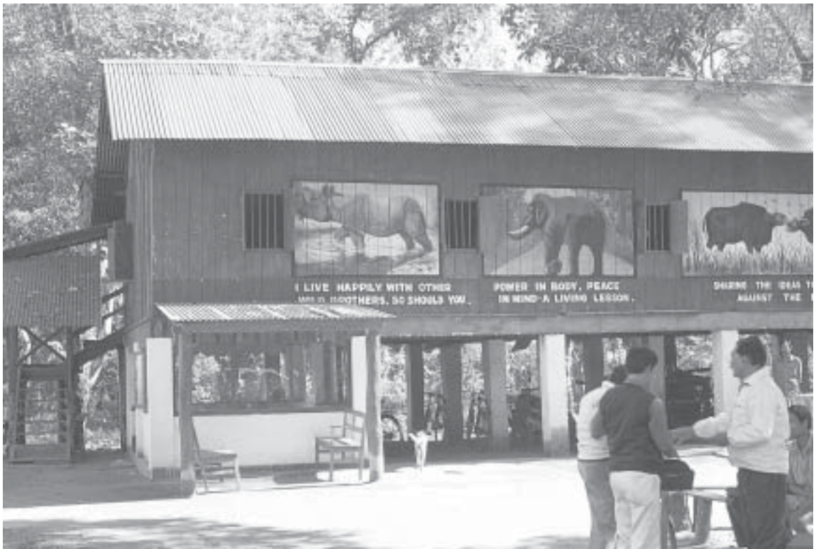
Paintings on the outside of the Hollong Forest Lodge publicize wildlife conservation. Built in 1972–1973, the lodge has seven bedrooms.