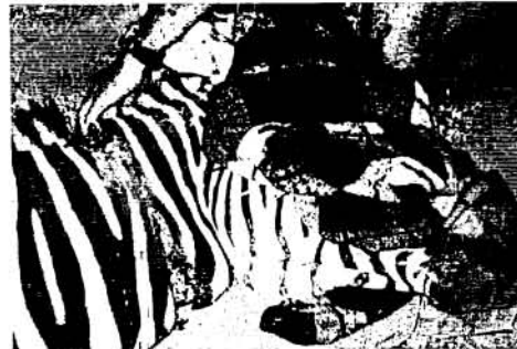
This zebra was rescued before the wires cut through his throat.

We want to introduce more anti-poaching units into the Hwange area in order to make a greater impact on the illegal snaring. We intend to seek the support of the David Shepherd Foundation in England, Born Free Foundation, Care for the Wild, UK Save the Rhino Group, TUSK, and the Hwange Lion Research, to fund this important project.