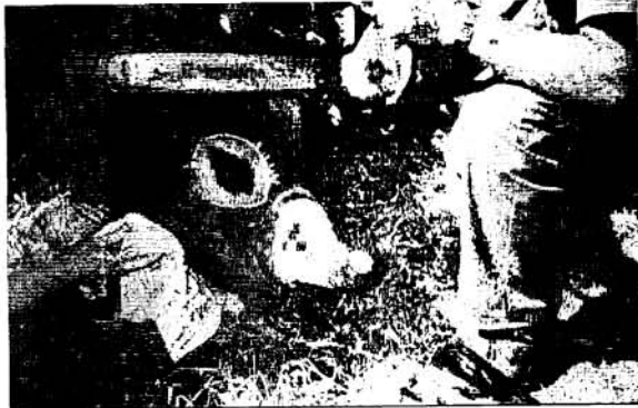
The Husqvarna chain saw cuts off the back horn and trims the front one.

The team proceeds to cover the eyes, cover the animal with grass and branches and spray it with water to keep it cool, and then it can start work. Horn removal is carried out with a Husqvarna chain saw, and Husqvarna have recently very kindly donated another one to help out.