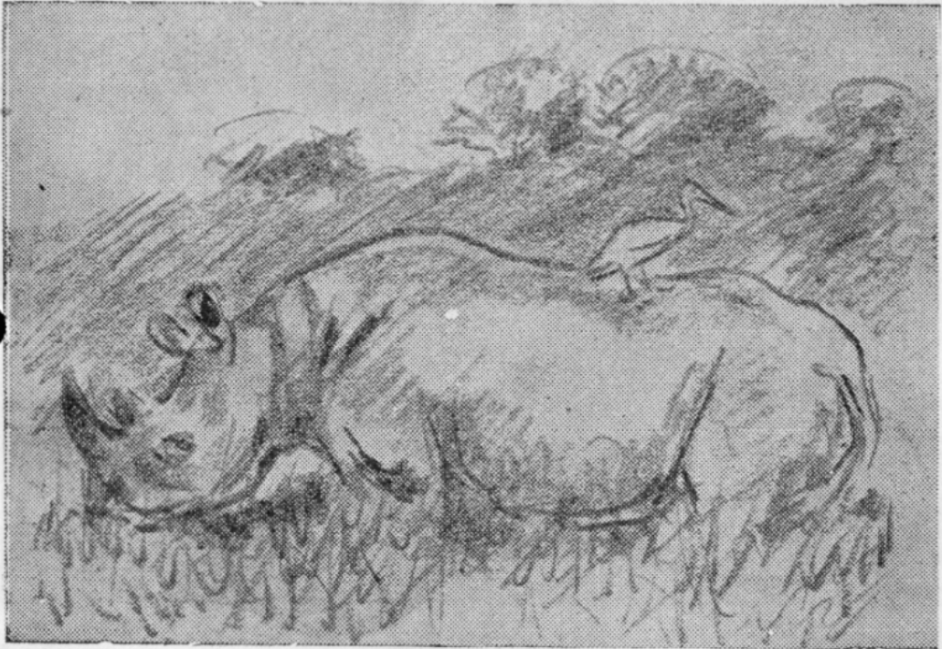
Sketch by M. Lucien Blancou