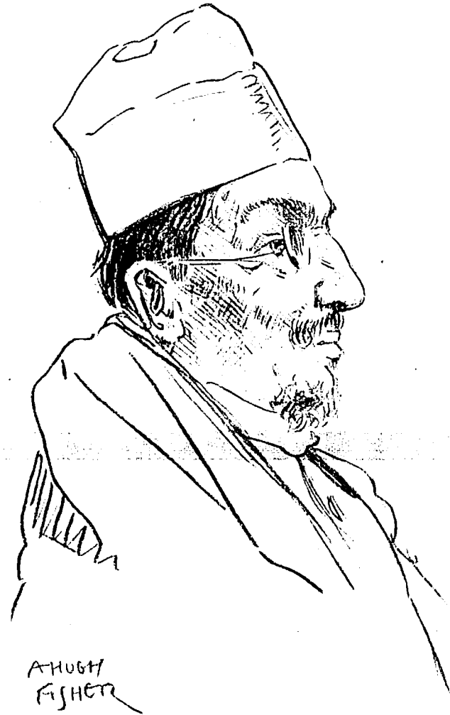
"A CHARMING OLD GENTLEMAN FROM DELHI."

But more beautiful is the Kampani Bagan,