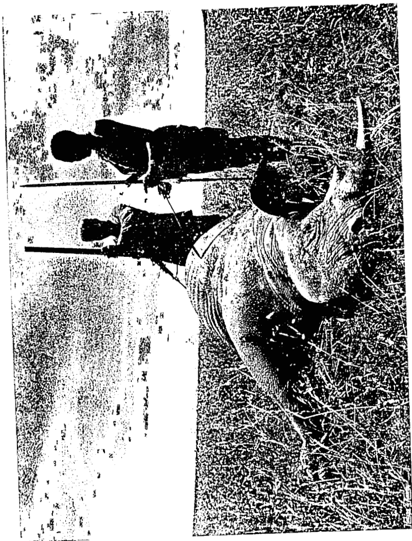
ON SENTRY OVER THE DEAD.

Known to the Boers as Zwart rhinoster , it is called by the Abyssinians Orarisse , by the Swahilis of East Africa Faru , by the Somalis Weel , by the Zulus and Matabele Upejana and Umpeygan , and by the Bechuanas Borele and Keitloa .