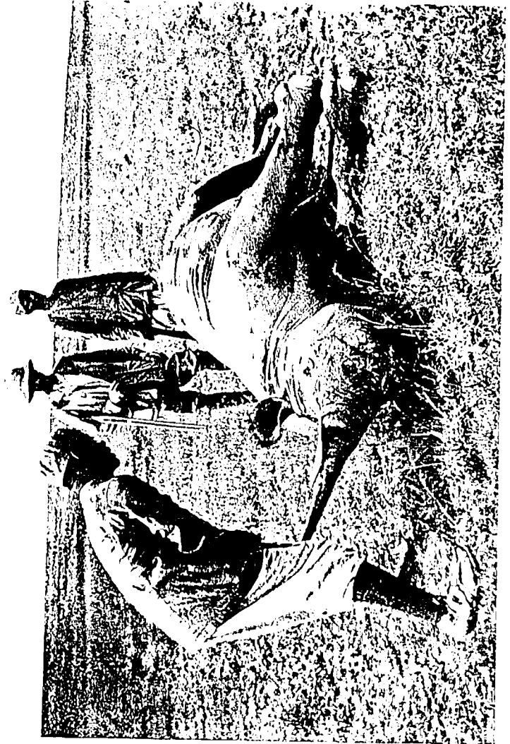
A RHINO WITH A 27-INCH HORN.

If it were not for the rhinoceros birds which are so frequently found in attendance on this animal, the rhinoceros would be much more often surprised at