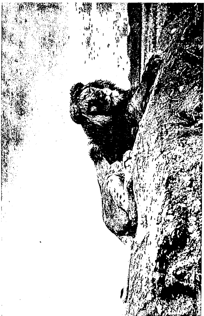
THE KING OF BEASTS

LONDON: PUBLISHED AT THE OFFICES OF "COUNTRY LIFE," LTD. TAVISTOCK STREET, COVENT GARDEN, W.C., & BY GEORGE NEWNES, LTD. SOUTHAMPTON STREET, STRAND, W.C. NEW YORK: CHARLES SCRIBNERS' SONS MCMV