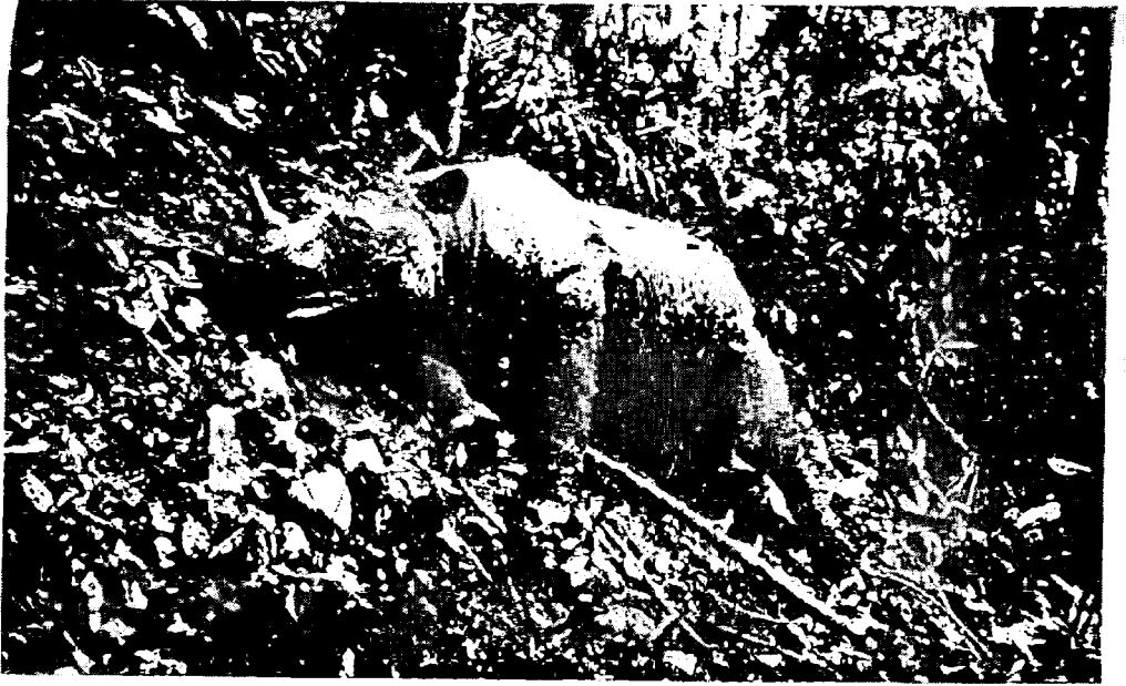
Facing Page 244 RHINOCEROS (SUMATRENSIS) SHOT IN 1914 AT 4,000 FEET ON MAIN RANGE ABOVE KUALA LUMPUR