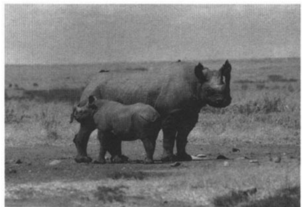
FIG. 1. Diceros bicornis in Nairobi National Park; subadult male and young.

DIAGNOSIS. Diceros bicornis (Fig. 1) is a dicerotine rhinoceros with anterior dentition absent or rudimentary, and occipital crest protruding posteriorly. The jaws and nasals abruptly end not far in front of the level of the anterior premaxillae; the mandibular