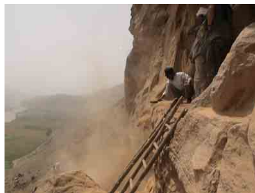
Clearing excess dust in preparation for the scan.

The 3-D image captured of the relief means that it can be studied in some detail by scholars without actually visiting the site, and the data contained in the image could also be used to produce a scale model for the Kabul Museum, other museums or future research.