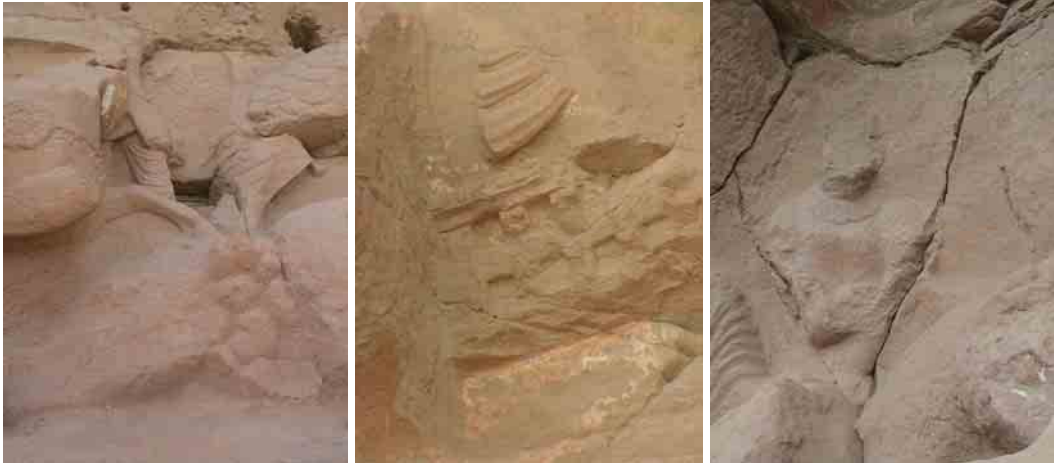
Detail of middle section.

However, clear traces of the outline of the main figure's torso and head remain where the figure emerges from the rock. The legs of this rider, attached to the horse in side-saddle fashion, are still visible though the feet have broken off. The outline of the hair in of the rider in typical Persian royal style lends weight to his identification as a Sassanian King.