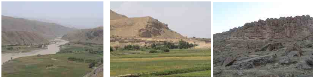
Southern entrance to the valley from the site. Village of Shamarq from the south-east. Cliff where relief is located from the east.