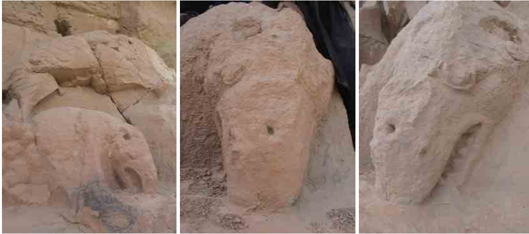
Fleeing animal with scaled armour.

Sassanid Kings Shapur I & II to expand their influence in Afghanistan during the 3 rd and fourth centuries AD.