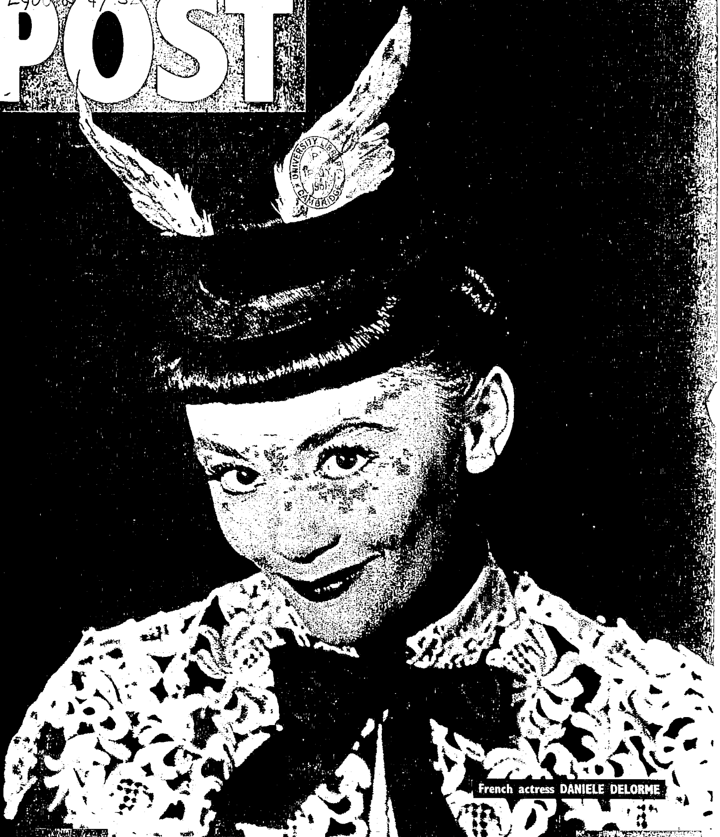
French actress DANIELE DELORME

56 NON-STOP PEEPSHOW 4 p PAGES 21 JULY 1951 HULTON'S NATIONAL WEEKLY VOL. 57, NO. 3