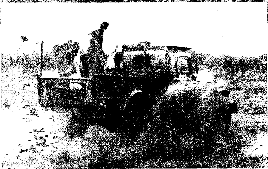
A Counter-attack: The Battle Reaches Its Peak

Enraged, the rhinoceros turns on his enemy. His horn tears through the truck as through cardboard. But he fails to use his advantage: suddenly, surprisingly, he becomes docile.