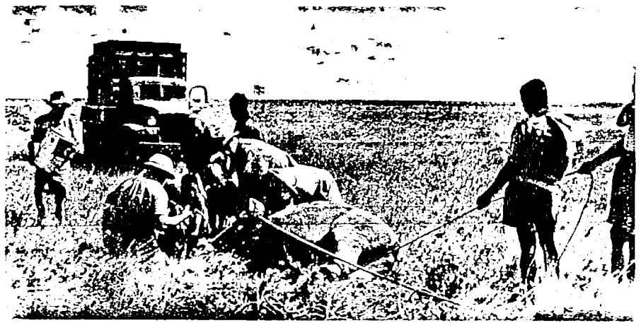
A Lasso Round the Feet: The Finish For several terrifying minutes, the boys have held him with the head lasso. Another group lassoes his legs: he falls, and is quickly shackled. The cage awaits him.

worn down. At any time, he may try to charge a truck, and if he hits one at his charging-speed of 30-odd miles an hour, he's pretty sure to get the best of it; in the confusion, he stands a fair chance of escaping. If he doesn't succeed, there comes a time when he tires and stops. The trucks close in, and soon the first lasso is round his neck. The boys play him on foot now, keeping their rope always taut. A second party moves up and lassoes his legs. After that, he's easily toppled. Once captured, he soon reverts to his peaceable ways, and in a few days he is eating out of his captors' hands. A gentler, less energetic way of catching rhinoceroses is that of grasping them firmly by the tail, it is said. But no pictures are available, so far.