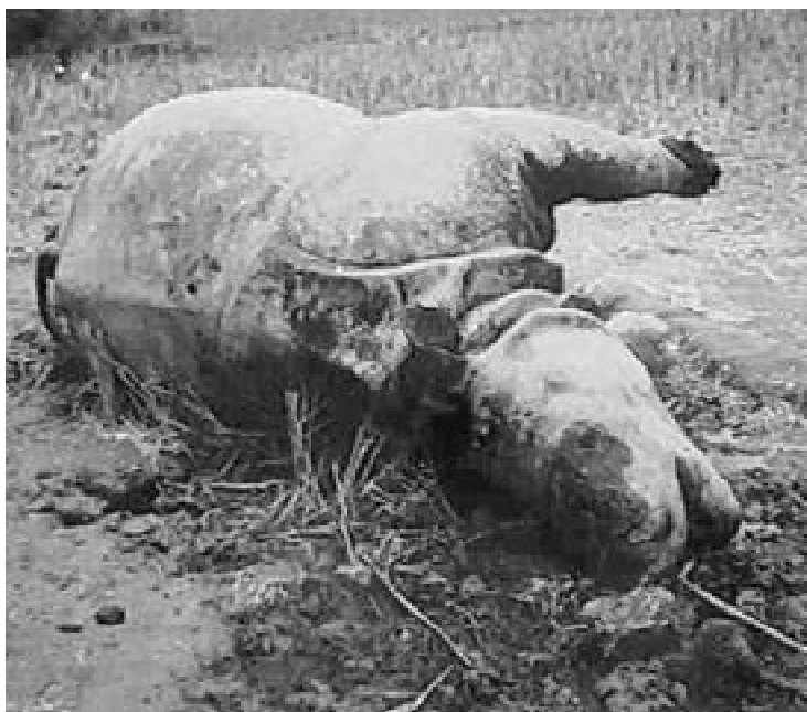
Poaching rhinos for their horn is the key threat to the rhino population in Assam.

endangered species. Poachers and their links to wildlife traders within the country and abroad all need to be identified. Wildlife trade is not confined to its country of origin; it cuts across the globe to wherever an illegal market still operates. This field study has amply indicated that poaching endangered species depends on the signal poachers receive from traders in the international market. It is the traders who indirectly determine the rate of poaching. Poachers on the ground will do little if traders do not buy the wildlife materials from them immediately, as storing such items invites risk of arrest and subsequent court trial with fines or imprisonment.