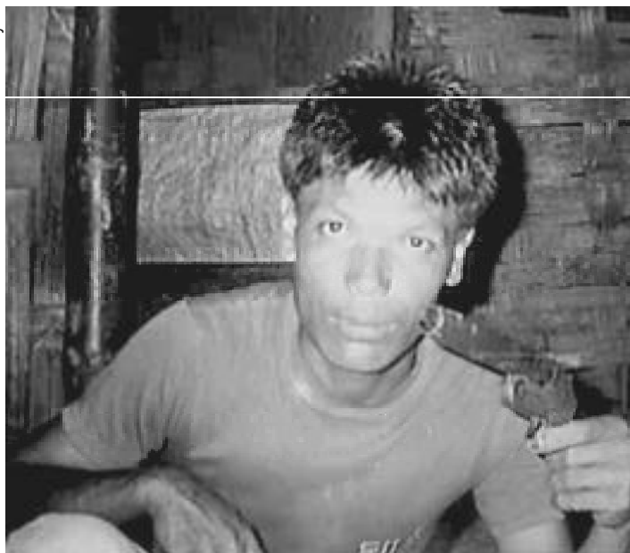
It is important to assess in advance what arms the poachers have.

visiting Phuntshiling and Thimphu. Acting at times as a buyer and at others as a seller, I visited people suspected of engaging in the wildlife trade, working in each country through a tourist guide and a network of intelligence units.