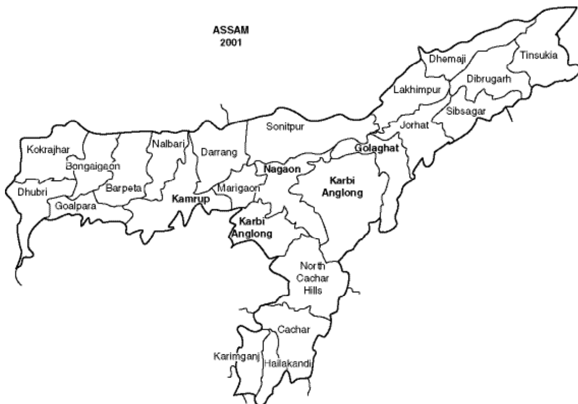
Figure 3. Assam state showing districts.

This study found that poaching elephants for their ivory has increased in the forest, especially outside the protected area network. From 1998 until 2002, more than 17 elephants were poached in various parts of Assam exclusively for their ivory, including one big elephant at Laokhowa Wildlife Sanctuary. In parts of Meghalaya in north-eastern India, elephants are also killed for their meat, which is dried and stored. The agents involved in the project have determined that some 14 elephants were killed for meat along the Assam–Meghalaya border, especially in Kamrup and Goalpara Districts. According to available records, 18 elephants were killed in Assam in 1997, 20 in 1998, 12 in 1999, 20 in 2000, increasing to a loss of 61 in 2001 and 39 in 2002, making a total of 170 killed over the six-year period. Maintenance of records on elephant poaching is poor, however, especially in the forest areas outside the protected area network. Poor record-keeping occurs throughout India. It is possible that poachers have killed many more elephants in the reserved forest areas of Assam without the forest staff having noticed.