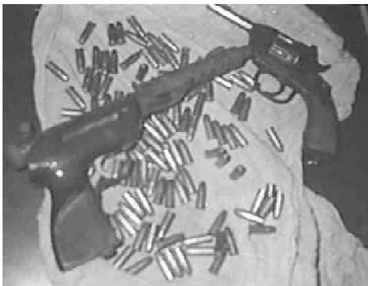
Recovering arms and ammunition is one step in working to reduce poaching.

lethal weapons than are their counterparts who work in urban areas. In a protected area where the number of endangered species is large and the threat of poaching is high, the main goal of wildlife officials and those working in other law-enforcing agencies is to reduce poaching without losing any member of the anti-poaching unit to illness or outright attack. One species particularly threatened by poaching is the rhino. Conserving rhinos in Assam, India, is a relentless fight with poachers and smugglers (Vigne and Martin 1998; Talukdar 2000).