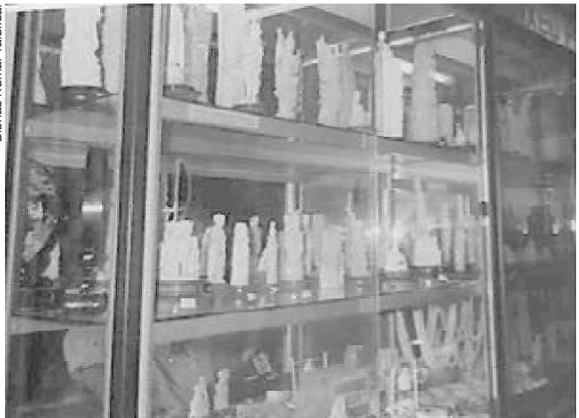
Ivory products for sale in Mandalay.

other South Asian countries. But most underworld activities are carried out in remote areas and even if someone has information they withhold it from law-enforcing agencies for fear of serious underworld reprisal. It is therefore imperative that clandestine channels of information collection be protected to assist the anti-poaching staff.