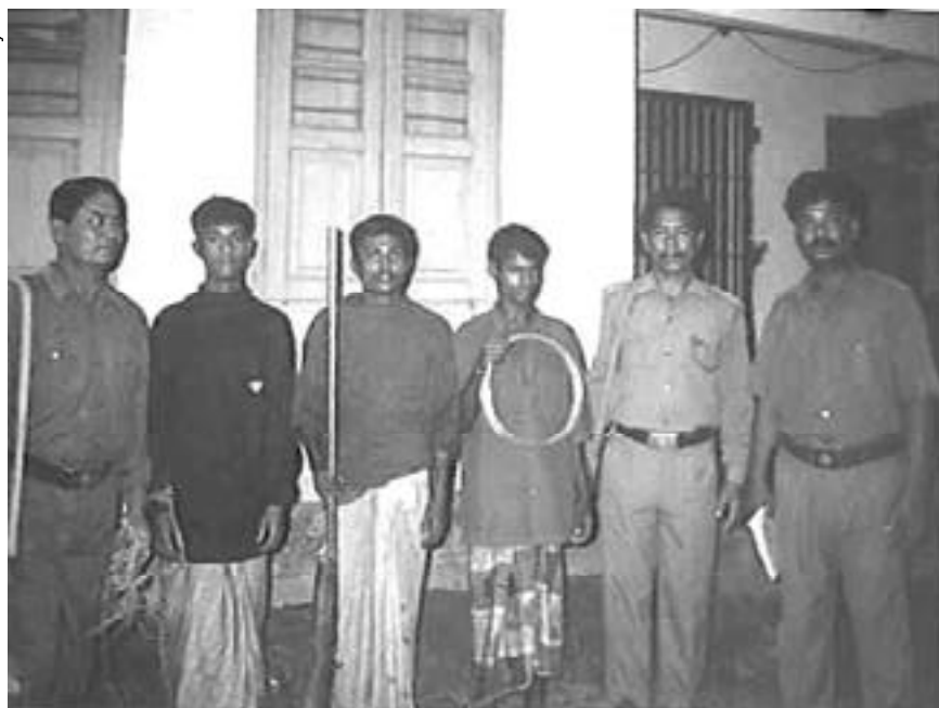
This anti-poaching squad operation was successful, recovering arms, ammunition and a rhino horn.