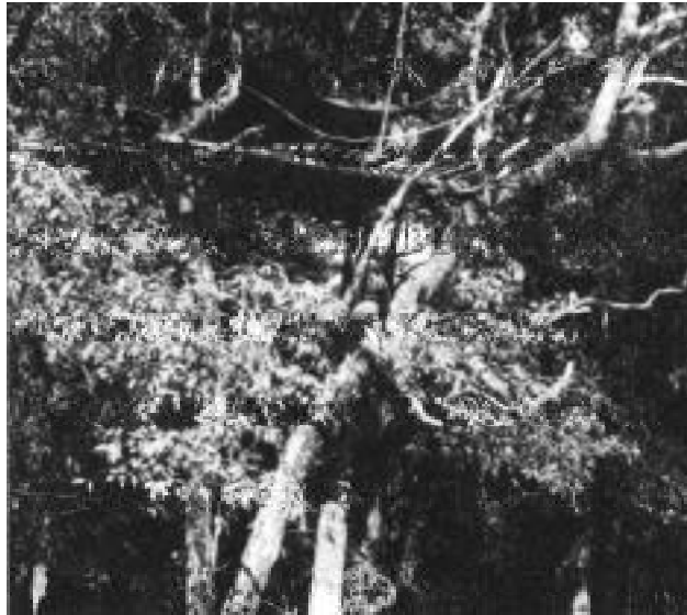
Farmers living near Jaldapara sit on “machans ‘or elevated platforms, such as this one, scaring away wild animals at night from their fields.

Bhutanese smugglers usually transport rhino horn by road from Phuntsholing to the only airport in the country at Paro. The airport was opened in the early 1980s, but only the national airline, Druk Air, is allowed to use it, due to the hazards of landing and taking off in the high mountains. The airline at first used two small German-made aeroplanes (Dorniers) to fly to Calcutta, Dhaka and Kathmandu. In the mid-1980s one BAE 146 aircraft (with four jet engines,