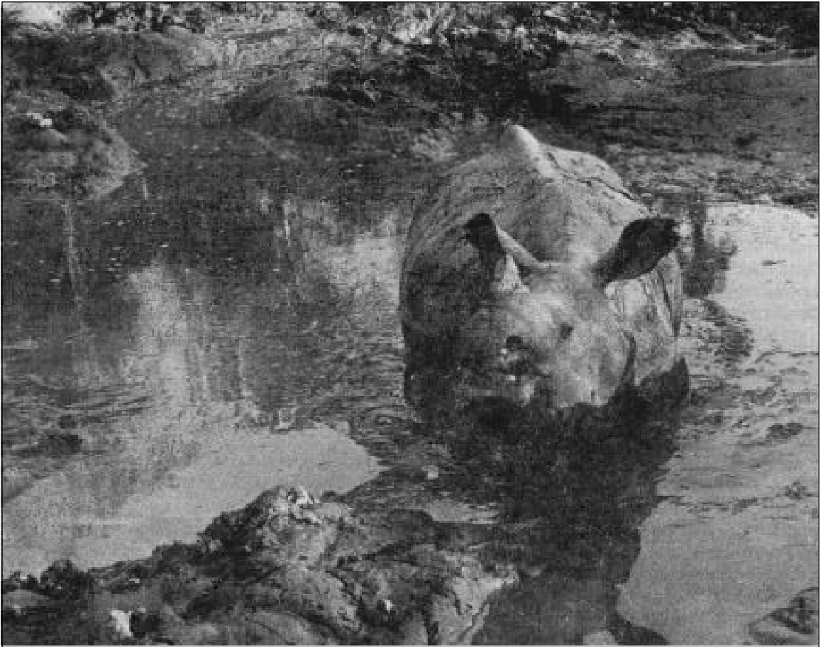
Greater one-horned rhinos exist in three areas in India Assam with about 1,400, northern West Bengal with 47, and Dudhwa National Park in Uttar Pradesh with a re-introduced population of 12.