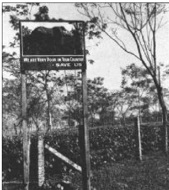
Signs are seen around the tea plantations near Jaldapara Wildlife Sanctuary for the purpose of encouraging local concern for rhinos.

In the late 1960s in the northern part of West Bengal, there was some demand for rhino horn for use in