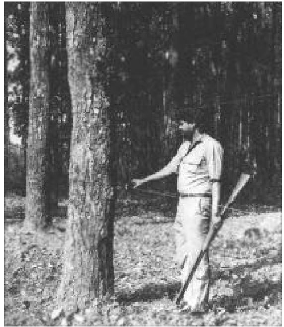
In the northern part of West Bengal elephants are responsible for considerable crop damage so electric wires are put up as a deterrent Rhinos, however, cause very little damage compared with elephants.

So through which route has most of West Bengal's rhino horn been leaving India in recent years? From confidential sources in West Bengal, Assam and Bhutan, it appears that traders in Bhutan from at least the mid-1980s to the present have been buying the majority of West Bengal's horns. Usually the horns are taken overland from Siliguri to Phuntsholing on the border with India in south-west Bhutan (see map). Phuntsholing is a trading town and, unlike other parts of the country, Indians can go there without a visa. Many Indian businessmen, especially Marwaris, as well as traders from Nepal and Bhutan, visit Phuntsholing in order to buy and sell various goods. Rhino horns from West Bengal are brought to Phuntsholing sometimes by people of the Bodo tribe (originally from Assam) living in West Bengal (where they are called "Mech"). In 1992 they sold the horns to Bhutanese for around $8,600 a kilo. Bodos also bring to Phuntsholing horns from rhinos poached in Assam, especially from Manas National Park.