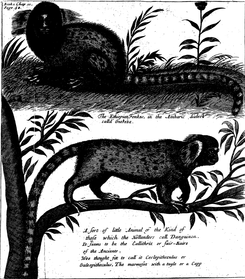
The Ethiopian Fonkes , in the Amharic dialect call'd Guerreza .

A sort of little Animal of the Kind of those which the Hollanders call Danguinen . It seems to be the Callitrich or fair-haire of the Ancients. Wee thought fit to call it Cercopitheculus or Galeopitheculus , The marmoset with a tayle or a Capp